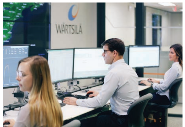
Wärtsilä Expertise Centre – Houston, TX, USA.